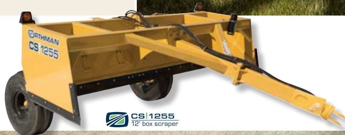
CS 1255 12' box scraper

The durable CS line comes standard with a tilt axle for further shaping of the working area and balanced loading of the scraper. With 12' or 14' cutting widths and capacities of 5.5 or 6.5 yards, the CS scrapers are excellent tools for the construction of terraces, building sites, roadways and waterways.