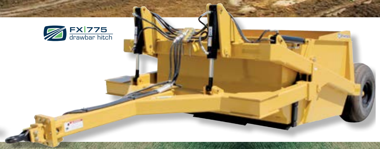
FX|775 drawbar hitch