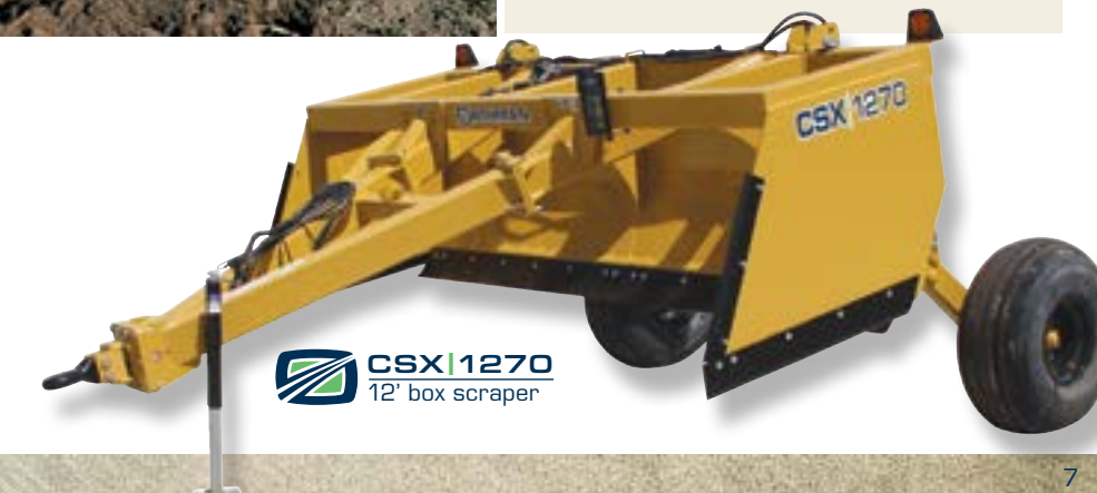
CSX 1270 12' box scraper