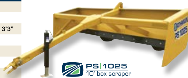
PS 1025 10' box scraper