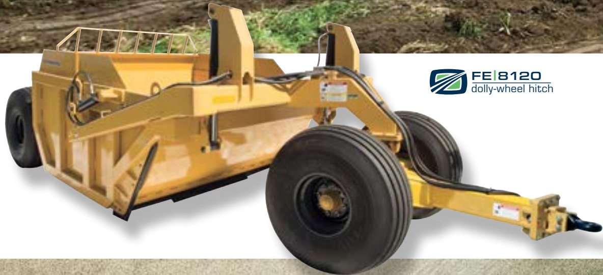
FE|8120 dolly-wheel hitch

Smooth interior design with heavy-duty greaseable steel guide rollers for reliable performance.